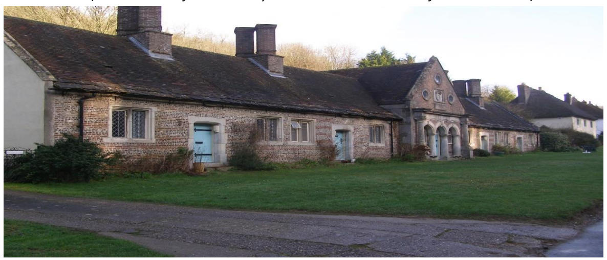
("These homes for the elderly were re-built in the Year of Our Lord 1779").

The inscription over the central doorway reads: "Haec Sedes Senectatis Reaedificata Est Anno Domini 1779"